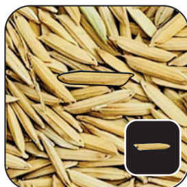
Paddy / Rough Rice