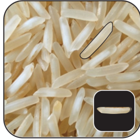
1509 Steam Basmati Rice