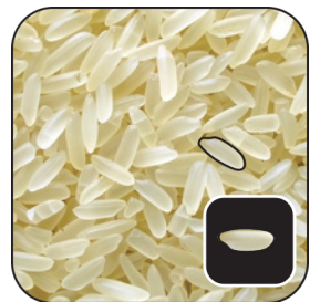
Parboiled Rice (Swarna) Medium Grain