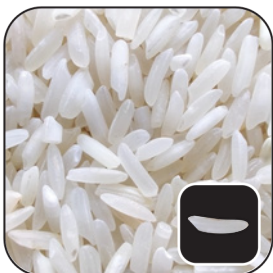
IR-64 Long Grain White Rice