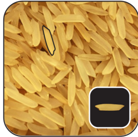
Sharbati Golden Sella Rice