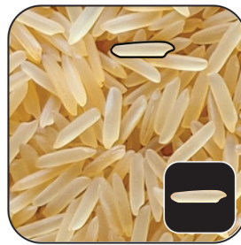
1121 Golden Sella Basmati Rice