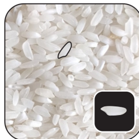
White Rice (Swarna) Medium Grain