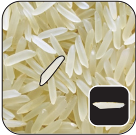
Sharbati Sella Rice