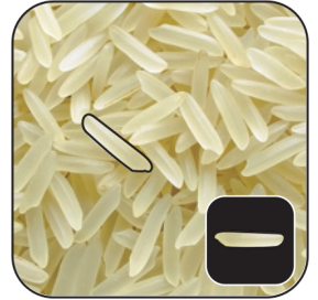
Sugandha Sella Basmati Rice