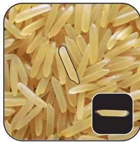
1509 Golden Sella Basmati Rice