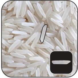
1509 Creamy Sella Basmati Rice