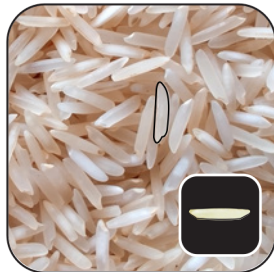
1401 Steam Basmati Rice