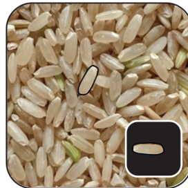
Brown Rice (Swarna) Medium Grain