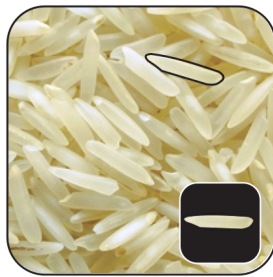
Pusa Steam Basmati Rice