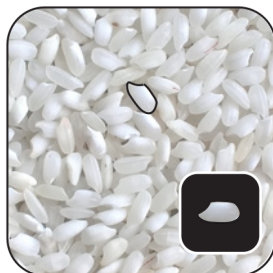
Round White Rice