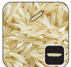
Sugandha Steam Basmati Rice