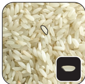
Sona Masoori Steam Rice