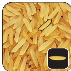
Sugandha Golden Sella Basmati Rice