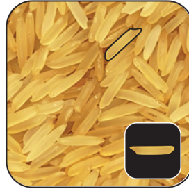
Pusa Golden Sella Basmati Rice