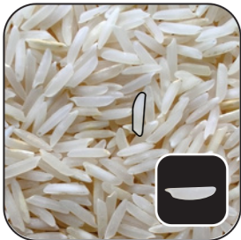
Traditional Raw Basmati Rice