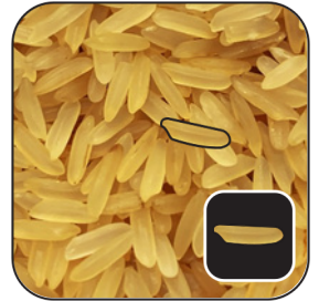
PR - 11 Golden Sella Rice