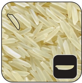
1121 Creamy Sella Basmati Rice