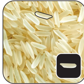
PR - 11 Sella Rice