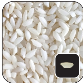
Jeera Kashala White Rice