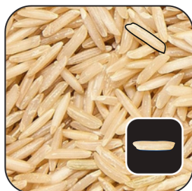
Brown Basmati Rice