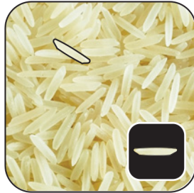
Sharbati Steam Rice