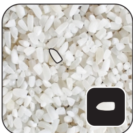
100% Broken White Rice