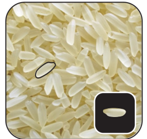
IR-64 Long Grain Parboiled Rice