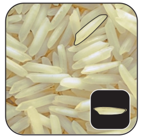
1121 Steam Basmati Rice